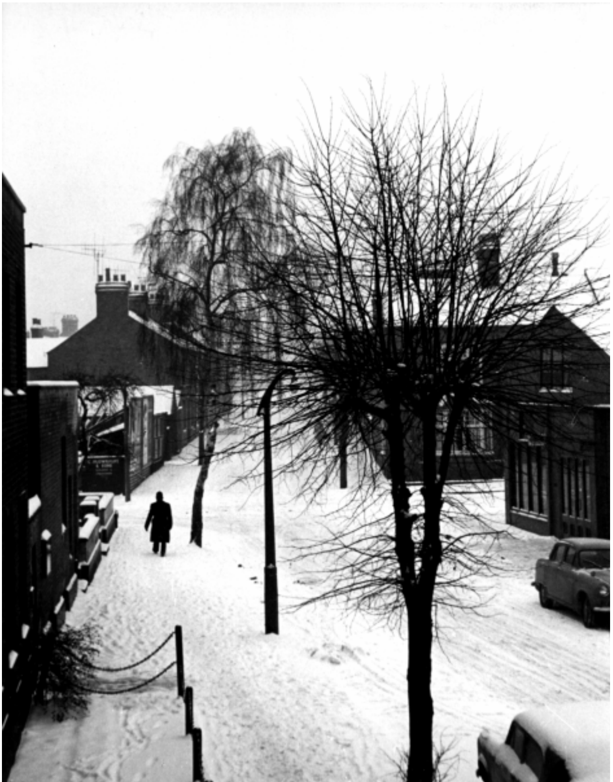
SNOW COVERED ABBEY STREET, MARKET HARBOURGH c. 1950.