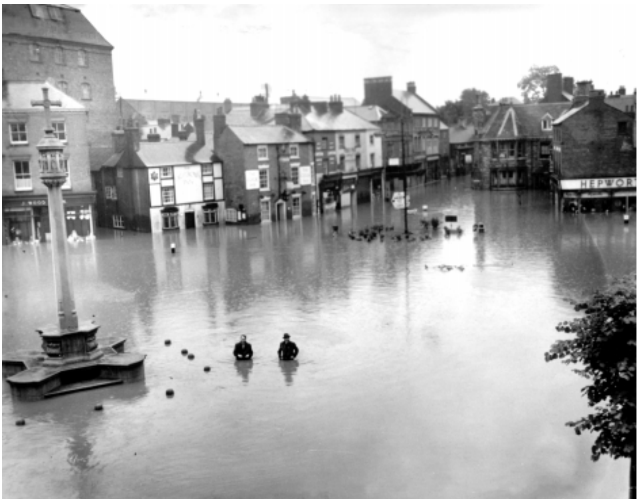
THE SQUARE, MARKET HARBOROUGH 1958.

Our coldest summer was probably 1972 which never really warmed up. It was not until the first week of July that a maximum of 70 degrees was recorded, a very unusual occurrence. August was the warmest month but even then temperatures were mostly below normal.