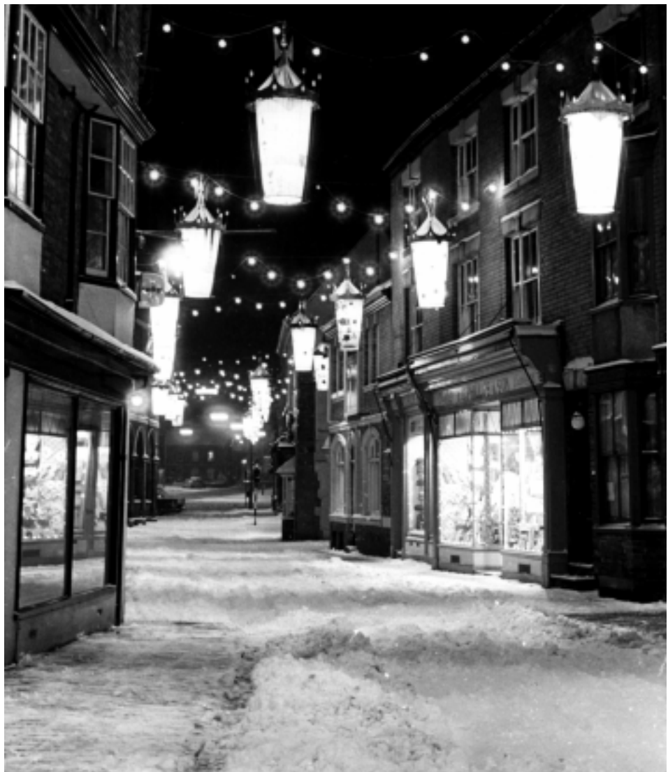
CHRISTMAS LIGHTS SPARKLING ON THE SNOW IN CHURCH STREET MARKET HARBOROUGH 1960S.

The 1970s started with mild winters but there was a gradual trend towards colder winters again. 1978/79 was a winter which never seemed to end for, almost without exception, there was cold weather from the end of November until mid March. This followed an autumn which was the warmest and driest for several years. The cold set in with a vengeance on December 31st and snow and frost continued throughout January and February. The heaviest snowfall of the winter occurred on the 14th and 15th February and this was accompanied by strong winds which caused drifts of several feet to form and many roads were impassable. March was mild at first but by mid month conditions were almost as bad as a month earlier. Heavy snow fell on the night of the 15th, followed by frost and it was not until March 24th that the winter was effectively over.