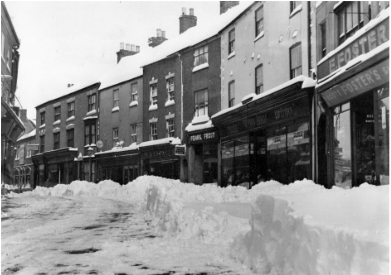
SNOW FILLED CHURCH STREET, MARKET HARBOROUGH MARCH 1947.

1940/41 was slightly less severe but it produced a cold spell which lasted for well over a month and 1941/42 had a cold spell which lasted for approximately two months. From