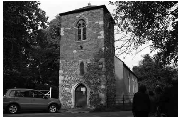
ST. LUKES CHURCH NEWTON HARCOURT.