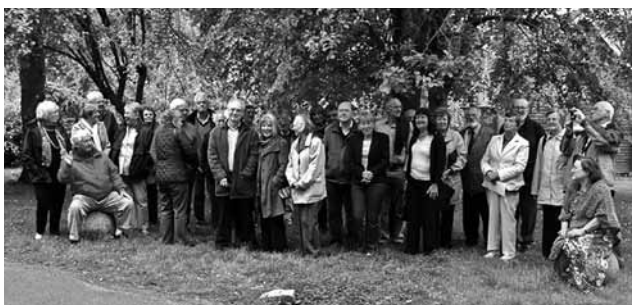
SOCIETY MEMBERS AT NEWTON HARCOURT.