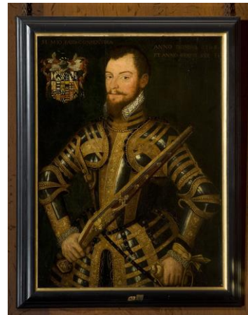
Sir Thomas Tresham