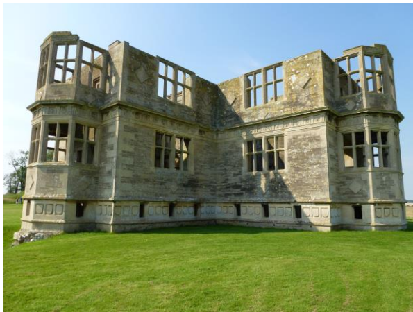
Lyvedon New Build