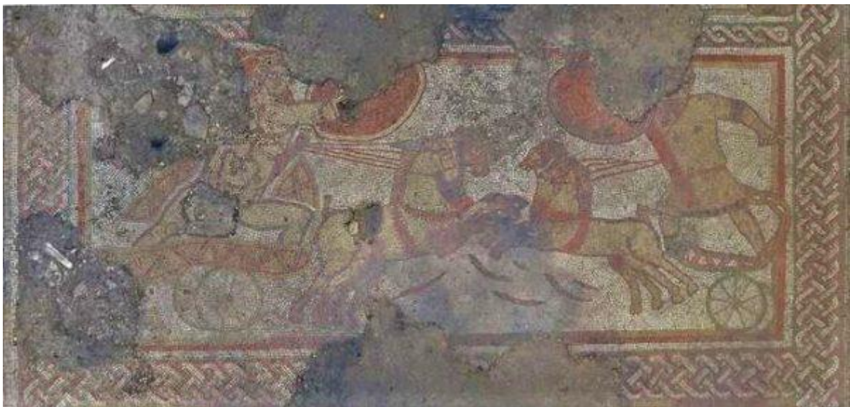
A scene depicting the battle between Achilles and Hector