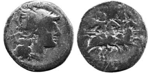
"THIS ROMAN COIN IS ONE OF THE EARLIEST EVER FOUND IN BRITAIN, IT IS A SILVER DENARIUS DATING FROM AROUND 187BC TO 211BC."

The internationally significant Hallaton Treasure will return, as will Falkner's boot and shoe making workshop. The museum displays will be updated with new showcases which will allow many more artefacts to be displayed and new stories told. There will be museum displays throughout the whole cultural space. The special temporary exhibition area will allow changing exhibitions and offer the possibility of loans from other museums.