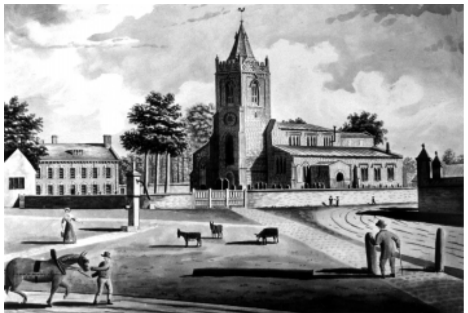
GREAT BOWDEN CHURCH WITH SOUTH FRONT OF OLD RECTORY c.1830.