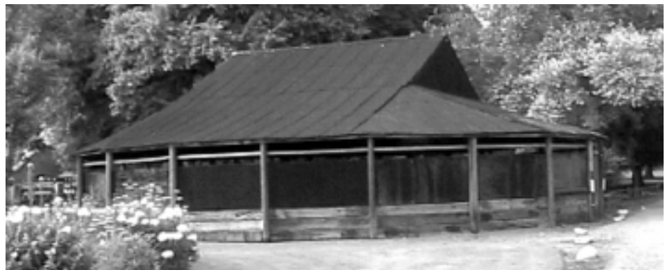
EXERCISE RING; BELONGING TO THE FERNIE HUNT.

Where did the Appraisal books go apart from the villagers ? Complimentary copies were sent to the Harborough District Council, Great Bowden Parish Council, Leicestershire and Rutland Rural Community Council, both Leicestershire and Northamptonshire Record Offices, Leicestershire County Council, all the local schools, museums at Market Harborough, Lutterworth and Hallaton, local libraries and further afield to the Society of Genealogists, British Association for Local History, the Public Record Office at Kew, and the British Library at Wetherby and many other potentially interested