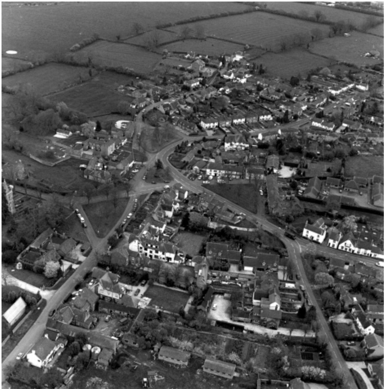
AERIAL VIEW OF GREAT BOWDEN 31 MARCH 1998.