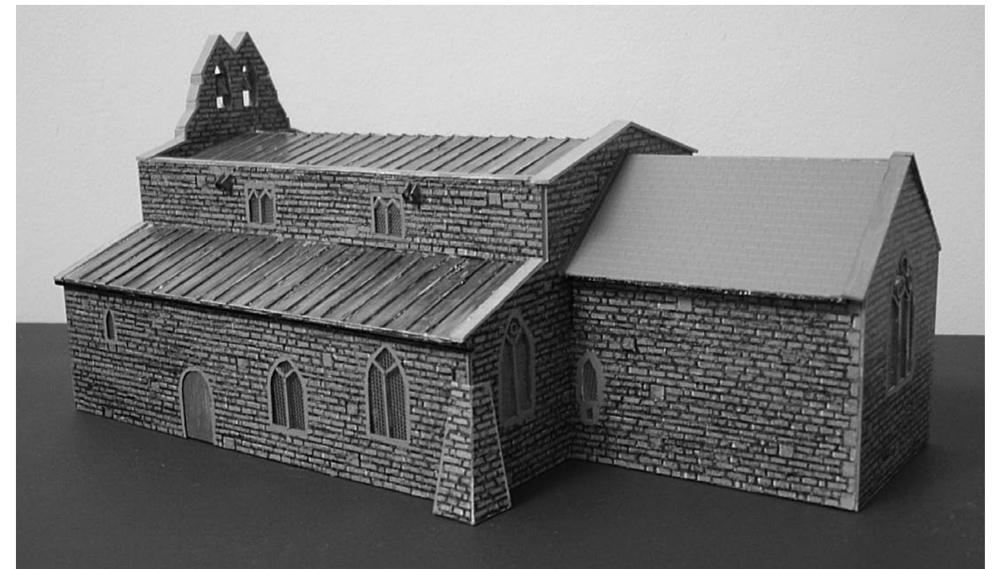
MODEL OF CHURCH