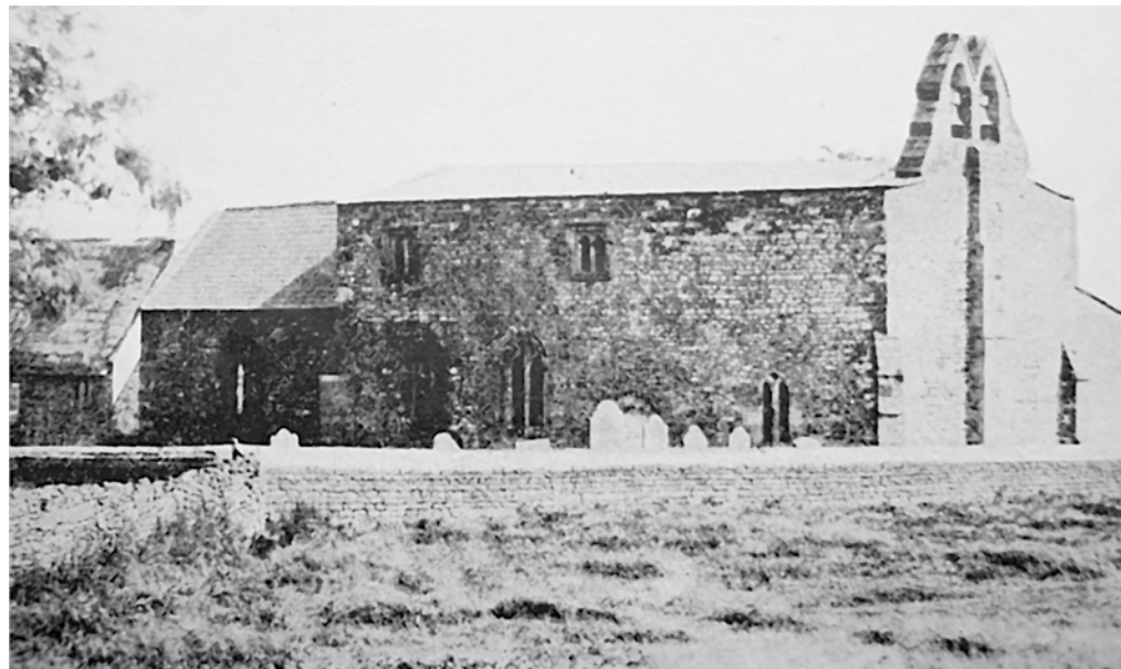
ST. DENIS CHURCH FAXTON IN THE 1860S.

Isolated, little used, crumbling and defenceless against vandals, both official and unofficial, St Denis church waited thirty years for its fate to be decided. In that time architects and surveyors, artists, writers and local historians visited the church in the fields, saw its state, commented, usually sympathetically, but passed on. A battle of words erupted, emotions ran high, accusations were made, appeals were sent to potential allies, forces rallied and hopes raised, only to be dashed. It was reminiscent of Anthony Trollope's The Warden , but this was a true story.