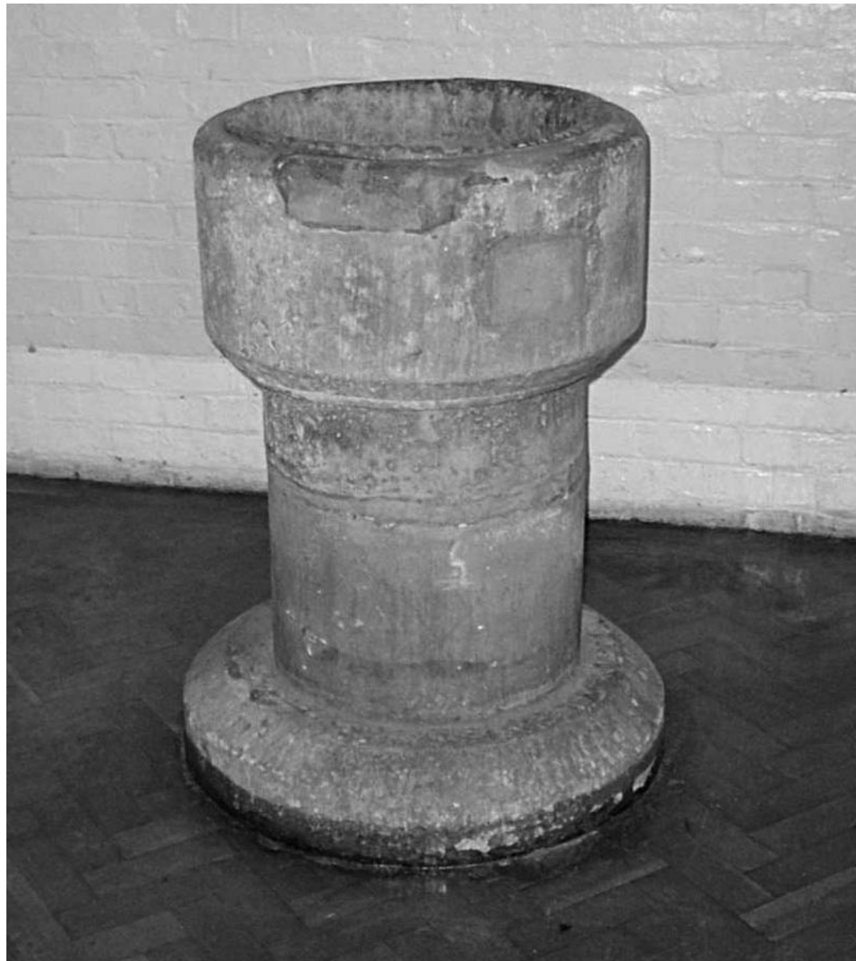
THE FONT OF ST. DENIS CHURCH NOW IN A KETTERING CHURCH.

She also wrote to express her concerns to the Bishop of Peterborough on 20th March. She asked him to request a further report from the SPAB as they might have suggestions that could avoid the remains of the church being demolished. She begged him to have a barbed wire fence put round the church. She added